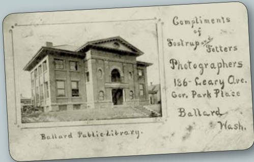
ABOVE: Ballard received its first library in 1904. It was built with a $15,000 grant from philanthropist Andrew Carnegie.

RIGHT: Legend, apparently unfounded, has it that Ballard's ordinances decreed that the number of saloons in the city could not exceed the number of churches. The taverns that did exist weren't always to the liking of the town's citizens. One petition requested denial of a liquor-license renewal to the Pioneer Saloon, located at 1st and Shilshole avenues, charging, "We do not think there is any question but that this saloon has been conducted as a resort for low men and women."