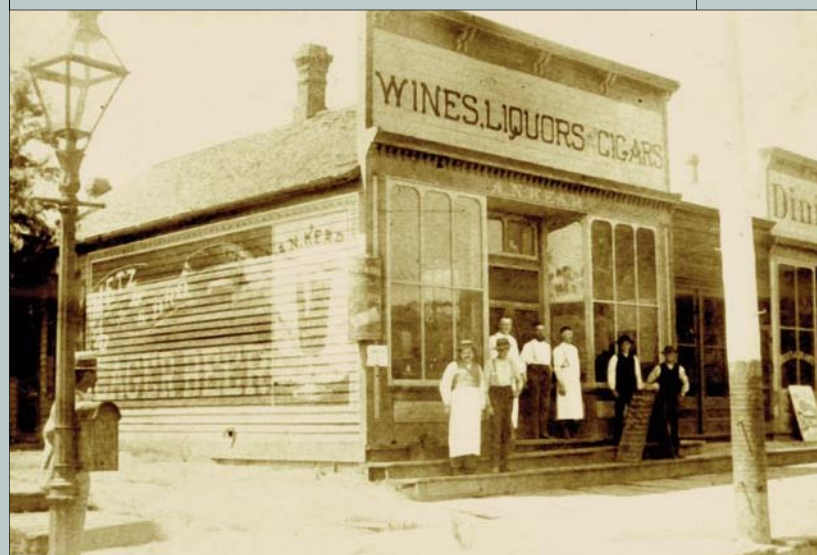
ABOVE: Before annexation, Ballard was a city in its own right, with many thriving businesses. This photo, taken around 1890, shows a liquor store and a restaurant in the business district. Museum of History & Industry, SHS11816