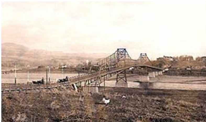
Vintage postcard of Lewiston-Clarkston Bridge, 1910s