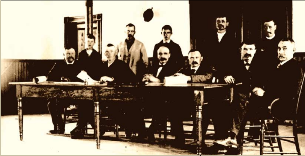
ABOVE: Columbia City Council at its first meeting, January 10, 1893.